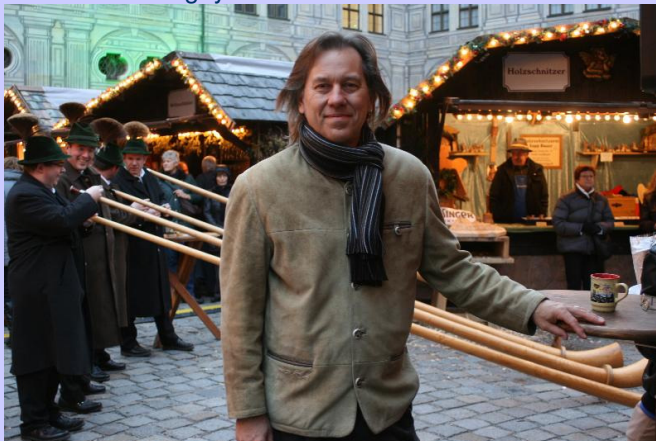
Don't know the origin of these horns, but they made a lovely sound!