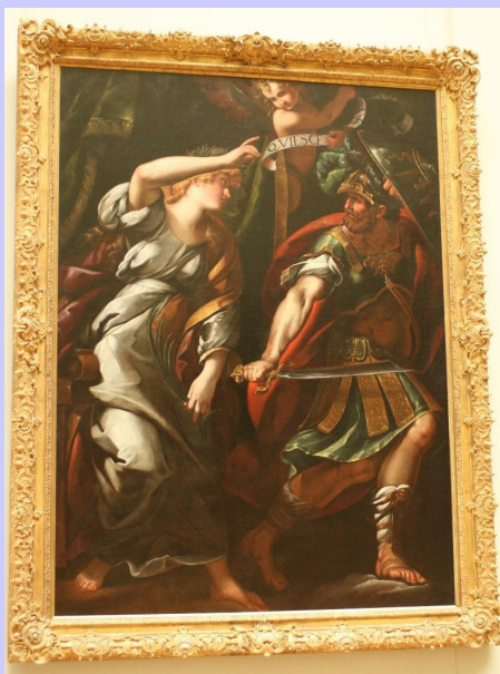
Mars Taking Action (Not Being Phased By Venus)