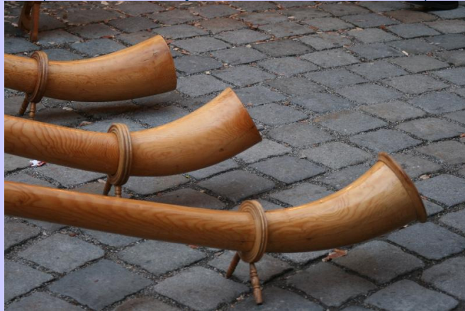
Members of The Tegernseer Alphorn Musikanten!

Alphorns really do help to make the season bright (at least it does if you love Bavarian Folk Music)!