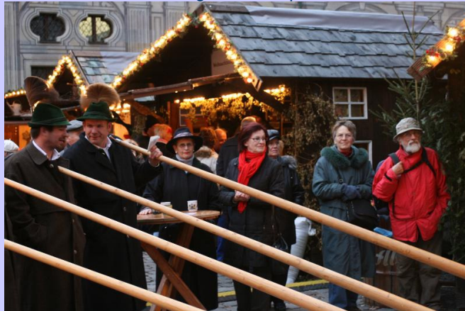
This guy loves Bavarian Folk Music!