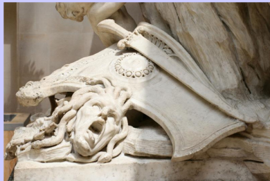
Medusa conquered (here in marble at The Louvre).

Medusa - fear and dread - a truly frightening image. When we encounter Medusa, our natural reaction is to turn away and definitely not look into her eyes (lest we be turned to stone and frozen in time)! In this regard, Medusa and Scorpio share a common theme, that there is something lurking in the depths of the darkness that needs to be healed.