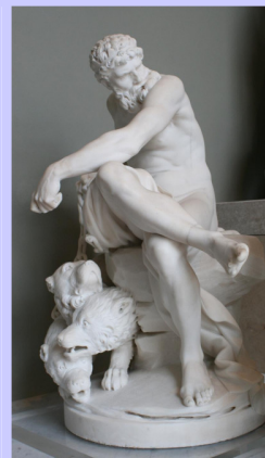
Marble Carving of Pluto